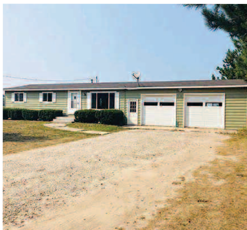
7767 ROGERS ROAD • EAST JORDAN