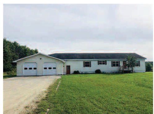
9560 ELLSWORTH ROAD • EAST JORDAN

This top of the line, manufactured home sits on a full walkout basement with a great view. The home has been completely renovated and is ready to move in. With 8' flat ceilings throughout. The basement is nearly finished and waiting for your final touches. The garage has 10' insulated ceiling and finished. This home is plumbed for a wood boiler and a third bathroom as well. All newer stainless steel appliances, custom counter tops, and many newer LED light fixtures. This home is located just outside East Jordan and close to Lake Charlevoix. MLS #456587. $159,900