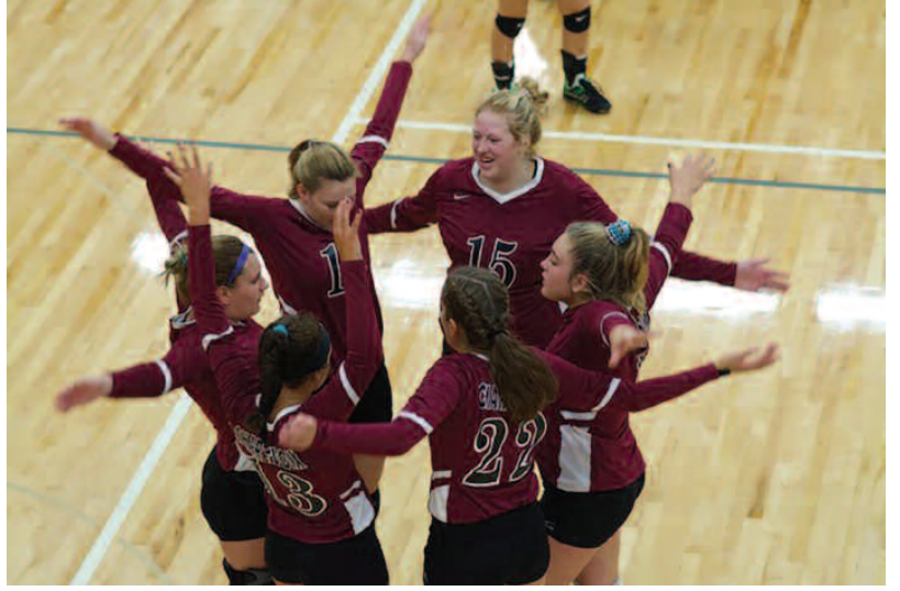
The Rayder volleyball team celebrates a point on their home court.

“The first and especially the last were charged up sets. I do have to say Ellie Louiselle stepped up and was a steam roller in the last set with eight kills in the last set,”