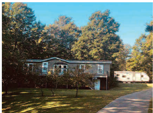
2487 ADAMS • EAST JORDAN

What do you think...Hunters Paradise or Gentleman's Farm? Barns 32x84 heated with water, 32x30 plus the 20x24 barn, all your storage needs for all those toys, 20 acres heavily wooded with rolling hills. House and Barn is heated by an outdoor boiler system. Now the home new siding and windows metal roof and a paved drive. 3 bedroom 2 bath with open floor plan plus a full basement for your entertaining needs. Elevated blind and tons of wild life just wander through the property. Snowmobile trails close by ... close to East Jordan and Gaylord. So which is it Hunters Paradise or Gentleman's Farm... you decide!? MLS #456668. $209,900