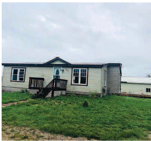
7474 ROGERS ROAD • EAST JORDAN

Great home close to town on approximately 2.5 acres subject to split approval, walking distance to the Jordan River. Newer windows and siding being completed. Close to Lake Charlevoix yet out of town with natural gas. Full walk-out basement, with a barn for your toys and an over-sized shed. MLS #456561. $135,900